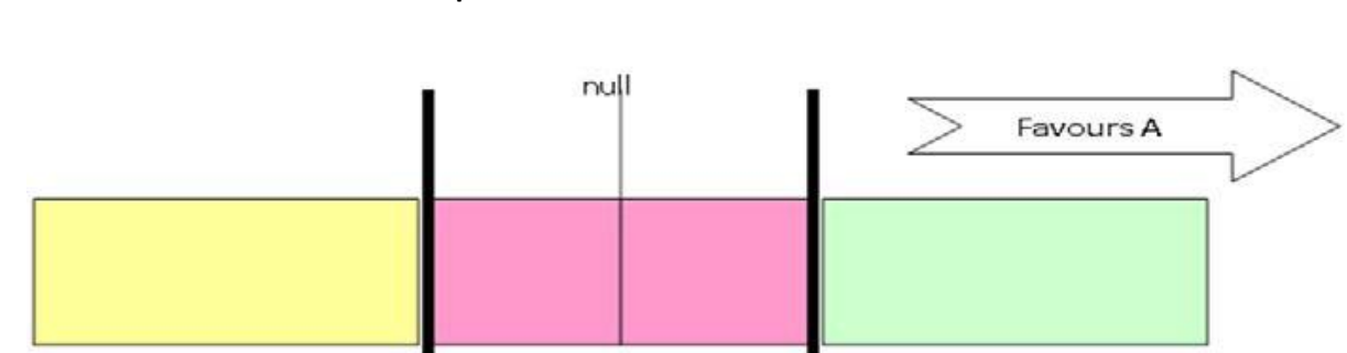
Figure 4: Illustration of precise and imprecise outcomes based on the confidence interval of outcomes in a forest plot

13 When the confidence interval of the effect estimate is wholly contained in one of the 3 zones (for