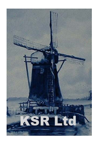
in collaboration with: