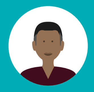
Occupational therapists help you to work out how to manage everyday activities more easily and independently

Intermediate care services are usually provided by a mix of health and social care professionals with a range of different skills. The team might include nurses, social workers, doctors, and a range of therapists: