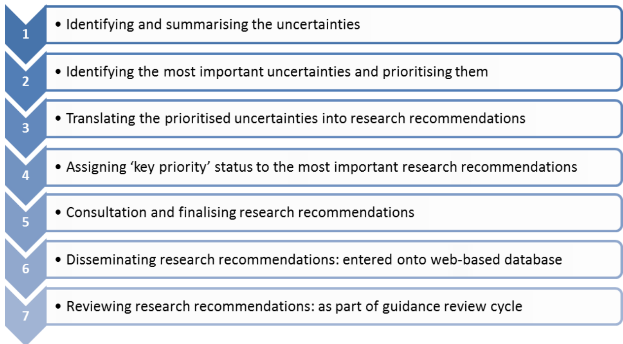
Figure 2: The NICE research recommendations process