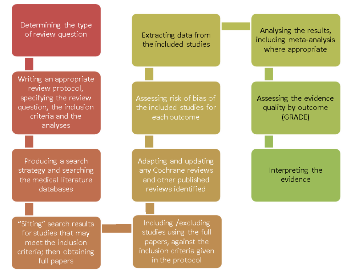
Figure 1: Step-by-step process of review of evidence in the guideline