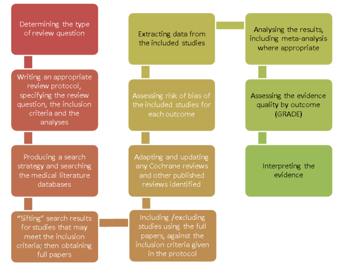
Figure 1: Step-by-step process of review of evidence in the guideline

Sections 2.1 to 2.3 describe the process used to identify and review clinical evidence (summarised in Figure 1), sections 2.2 and 2.4 describe the process used to identify and review the health economic evidence, and section 2.5 describes the process used to develop recommendations.