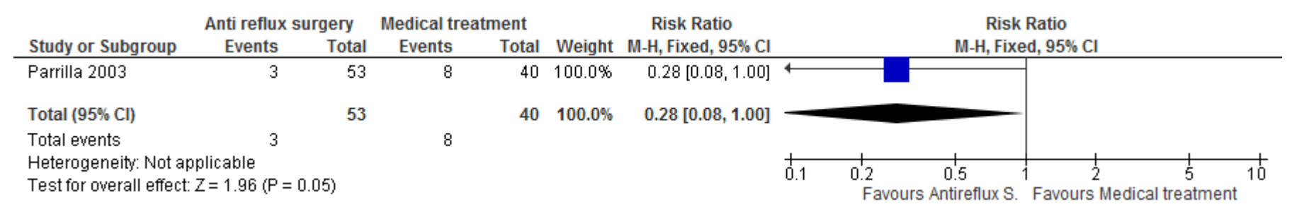
Figure 3: Dysplasia De Novo