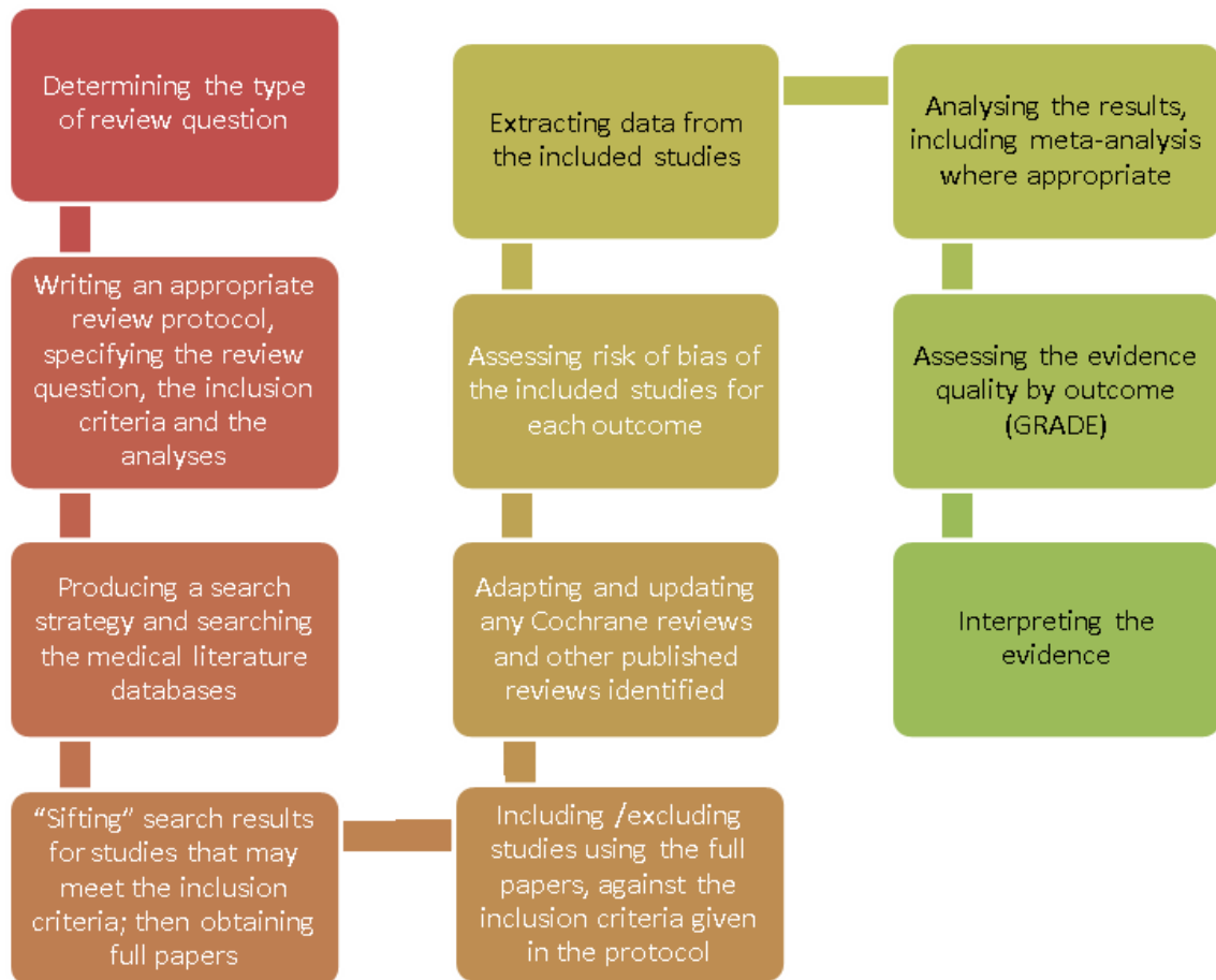
Figure 1: Step-by-step process of review of evidence in the guideline

Sections 2.1 to 2.3 describe the process used to identify and review clinical evidence (summarised in Figure 1), sections 2.2 and 2.4 describe the process used to identify and review the health economic evidence, and section 2.5 describes the process used to develop recommendations.