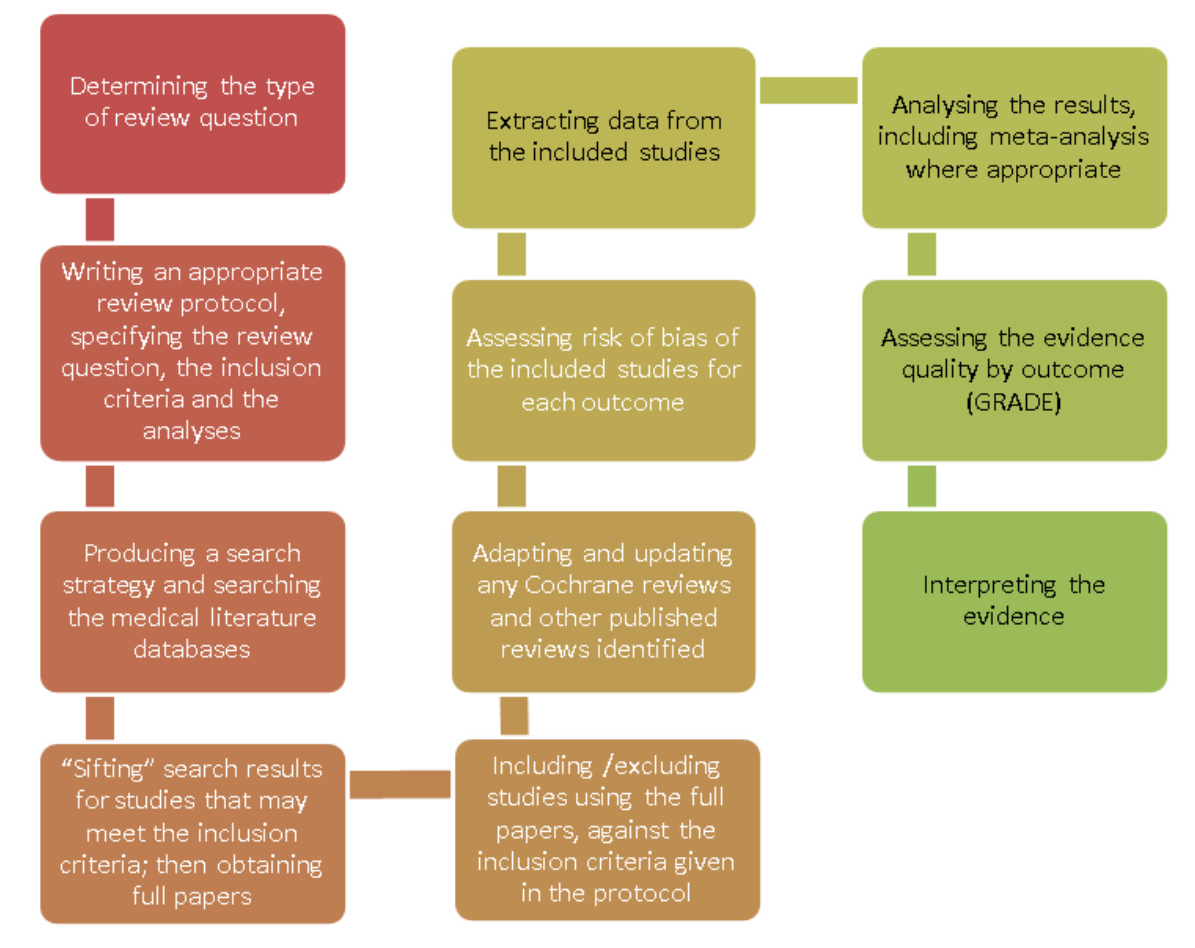
Figure 1: Step-by-step process of review of evidence in the guideline