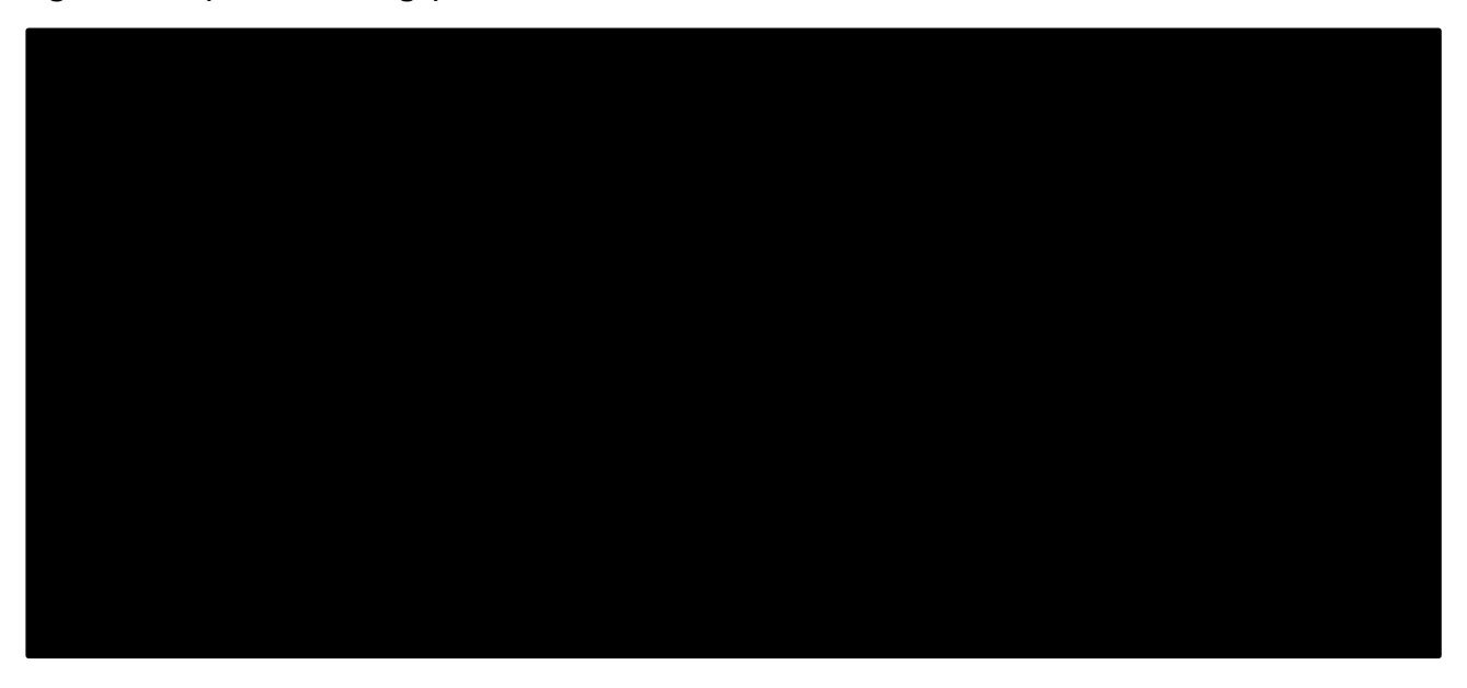
Table 8 Scenario analysis based on commercial agreement ("Roche waning")