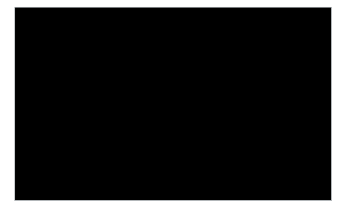
Figure 3. Exponential extrapolations for progression-free survival and exposure to everolimus in the BOLERO-2 trial

The company, therefore used the HR of to estimate the treatment costs with everolimus in the model, and produced Figure 3 to justify that based on visual inspection alone, using an exponential model in the analysis was a reasonable approach.