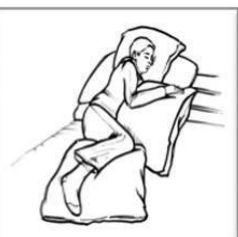
Adapted forward lean for lying