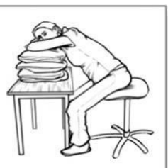
Adapted forward lean for sitting