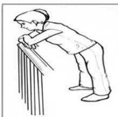
Forward lean 1