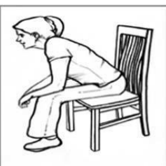
Forward lean 2